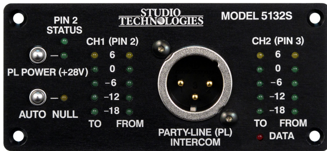
Model 5132S Party-Line Interface Module Front Panel

The Model 5132 Party-Line Interface Module is a compact, self-contained unit for use in custom broadcast, live-performance, and general party-line intercom applications. The module provides a high-quality 2-channel party-line to analog line-level (“4-wire”) audio signal interface in an easy to use yet technically sophisticated package. The module’s basic functions include two channels of 2-wire-to-4-wire conversion with auto-null capability, input and output level metering, a +28 volt DC party-line power source with two channels of 200 ohm intercom audio termination, and DC output control and status monitoring. With the internal party-line power source enabled, beltpack user devices can be directly connected. Alternately, the Model 5132 can be connected into an existing party-line system that includes a power source and intercom audio terminations. Two sets of 4-wire analog inputs and outputs interface the Model 5132 with a variety of external audio transport, intercom, and infrastructure equipment. Module operation requires only an externally-provided source of 12 volts DC. Advanced features include remote control and monitoring capability.